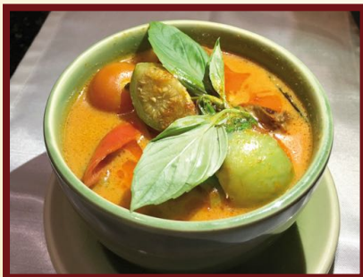
แกงเผ็ดเป็ดย่าง / GAENG PHED PED YANG Red curry with roasted duck