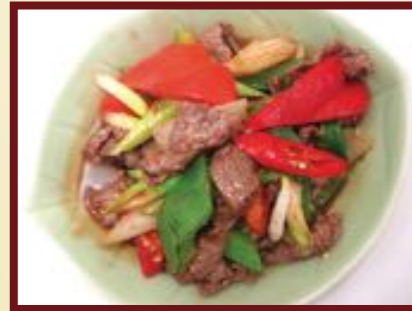
เนื้อผัดพริกสด / NUEA PHAD PRIG SOD Fried beef with fresh chili, onion and spring onion