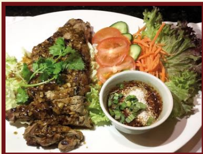
เนื้อสันย่าง / NUEA SUN YANG Charcoal grilled beef fillet served with spicy sauce