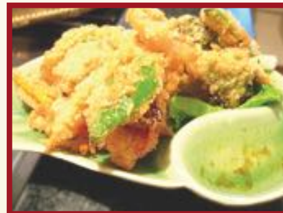
ผักรวมชุบแป้งทอด / PAAK RUAM CHOOB PANG TOD Fried mixed vegetables in batter served with plum sauce