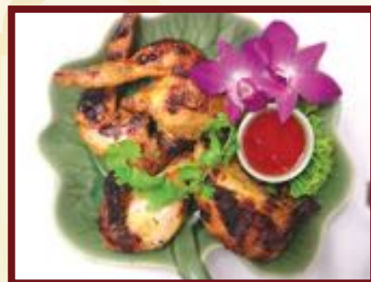
ไก่อ่าง / GAI YANG Charcoal grilled chicken marinated Thai style (on the bone)