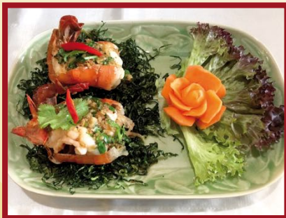
กุ้งใหญ่ทอดกระเทียมพริกไทย / GOONG YAI TOD KRATIEM PRIG THAI Fried king prawn with garlic and pepper