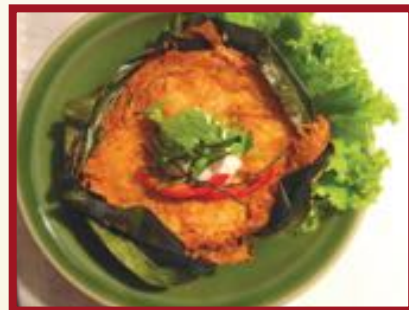
ห่อหมกปลา / HOR MOK PLA Steamed fish curry with cabbage and basil leaves in banana leaf bowl