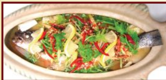
ปลาแป๊ะชะ / PLA PAE SA Steamed seabass in casserole in hot and spicy soup with lemon grass, salted plum and celery