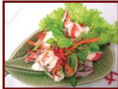
ยำทะเล / YUM TALAY Spicy mixed seafood salad