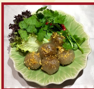
STEAMED TAPIOCA BALLS