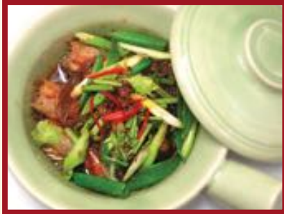
กุ้งอบวุ้นเส้น / GOONG OB WOON SEN King prawn cooked in casserole with pepper and glass noodle