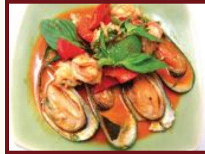
ผัดโป๊ะแตก / PHAD POH TAK TALAY Fried mixed seafood with curry paste and sweet basil leaves