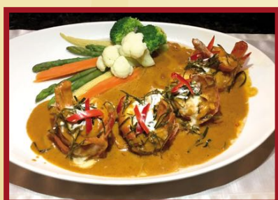
CHU CHEE KOONG