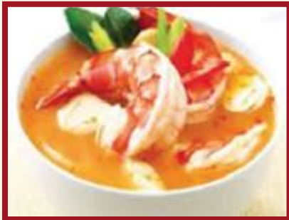
ต้มยำกุ้ง / TOM YUM GOONG Spicy prawn and mushroom soup with lemon grass, lime leaves and lime juice