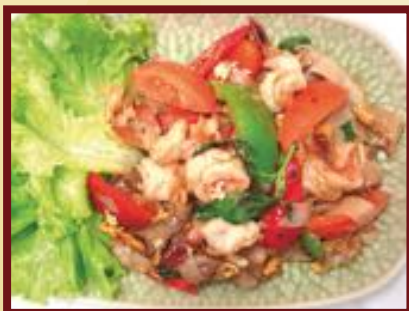
ก๋วยเตี๋ยวผัดซี๊เมากุ้ง / KUAY TEOW PHAD KEE MOW GOONG Stir-fried fresh noodle with prawn, basil leaf, egg and fresh chili