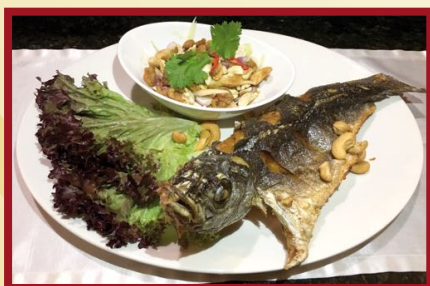
PLA TOD YUM MA-MAUNG