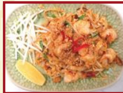
ผัดไทย / PHAD THAI Stir-fried rice noodle with prawn, bean sprout, peanut and egg Thai style