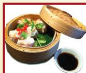
STEAMED PORK AND PRAWN DUMPLINGS

***If you suffer from a food allergy or intolerance, Please let us know when you place your order.*** 10% service charge will be added on the bill, minimum order on food of £10 per person requested