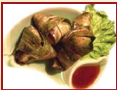
ไก่ห่อใบเตย / GAI HOR BAI TOEY Fried marinated chicken in pandanus leaf